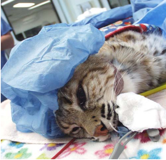
Pictured above: Pablo, one of the bobcats at The Nature of Wild- works in Topanga, CA.

At right: Pablo's infected paw prior to surgery has atrophied pads and abnor- mal bone positioning. Reconstructive surgery alleviated pain from bone fragments and repositioned the pads.