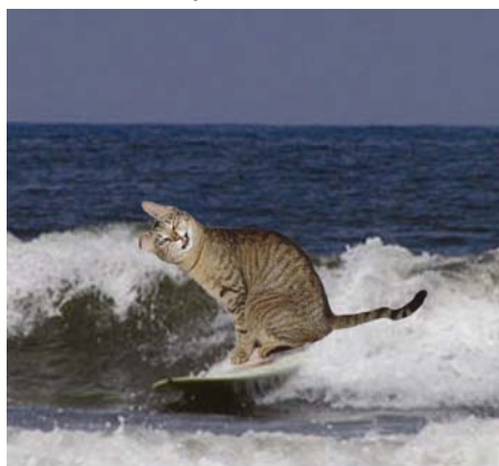
Above: "Hanging ten" claws in Malibu. Far right: Berkeley's most famous scratching post.

Four California cities, West Hollywood, San Francisco, Malibu, and Berkeley, have now passed resolutions condemning the practice of declawing, indicating the growing number of people who believe that declawing animals is inhumane and that sensible alternatives can be used to control scratching. The city of West Hollywood passed the first resolution against declawing and then went on pass its precedent setting anti-declawing ordinance in April, 2003.