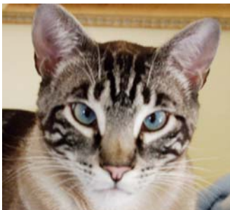
Seabiscuit had an uncredited cameo role in KCET's "The Paw Project"

"If you see injustice and say nothing, you have taken the side of the oppressor." Desmund Tutu